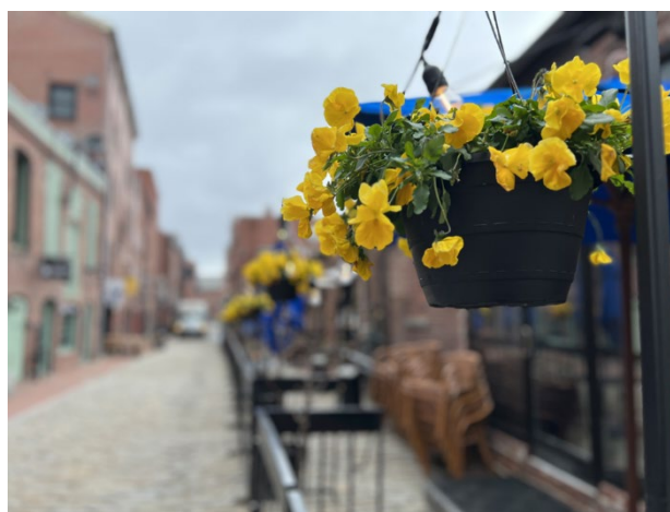
Wharf Street, Portland ME

Interest rates remain a focal point for markets in 2024. The Federal Reserve is expected to initiate multiple rate cuts starting this summer. However, it's worth noting that historical data suggests a reluctance to implement cuts during election years, with only one instance of a rate cut occurring during the May to November timeframe leading up to an election since 1994 ( ref. Bespoke Investment Group ).