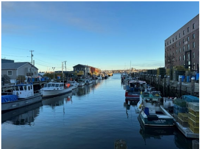
Portland Harbor

The allure of chasing returns in soaring asset classes, particularly the likes of the mega cap technology 'magnificent 7' and the world of Bitcoin, is undeniable. While market cycles wax and wane, the heart of our approach will always emphasize a dedication to fiduciary responsibility, the management of risk, and the preservation of long-term value. Our commitment to administering these